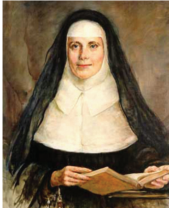
Mother Catherine McAuley Foundress of the Sisters of Mercy