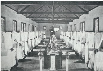
Boarding School Dormitory

A large earth tremor is felt in the dormitories, frightening boarders.