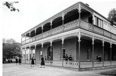
Stella Maris Juniorate

Stella Maris Juniorate is established at St Helen's.