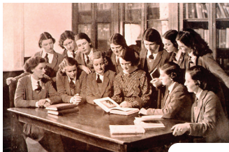
Literary Class 1934