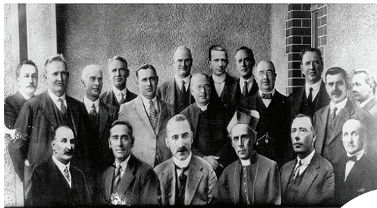
ST. CATHERINE'S GIRLS' ORPHANAGE EXECUTIVE COMMITTEE, 1928

St Anne's Primary School moves on-site to Sacred Heart College.