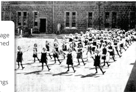
ST. CATHERINE'S ORPHANAGE, GEELONG. Physical Culture Group, Junior Division.