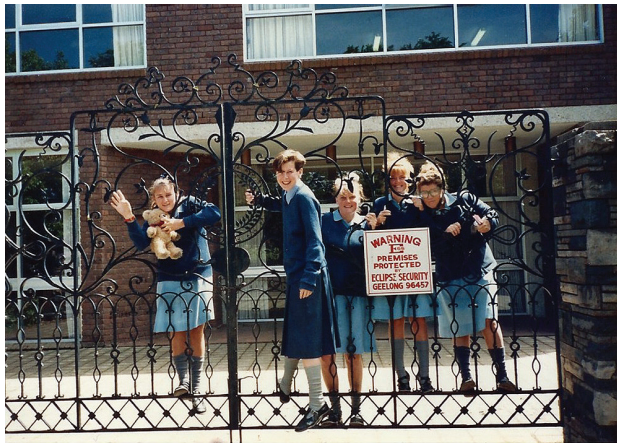
New Aphrasia Street Gates Installed